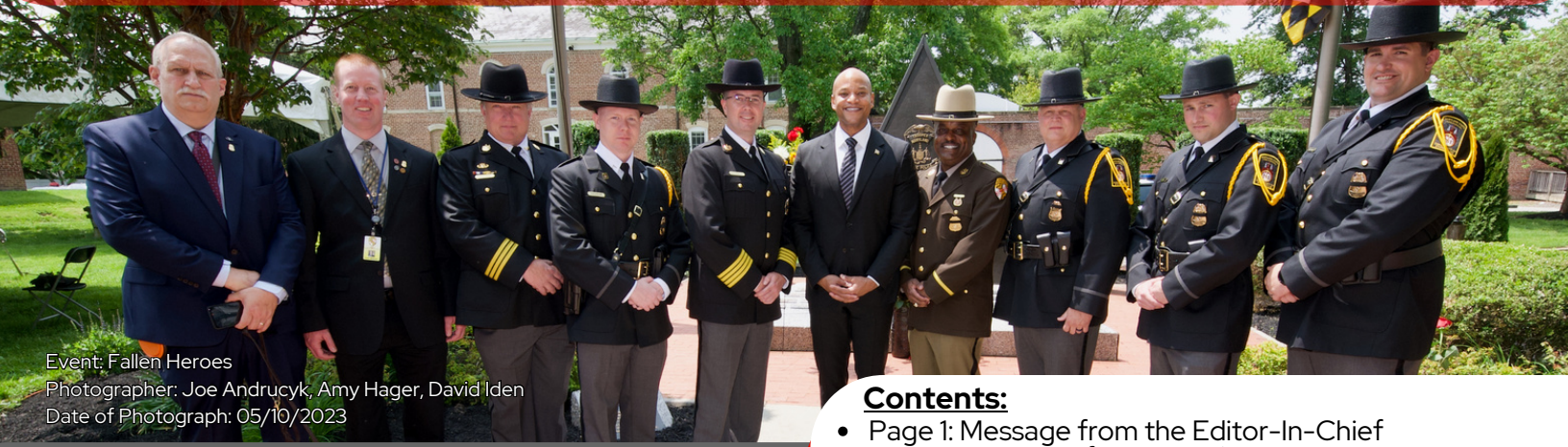
Event: Fallen Heroes Date of Photograph: 05/10/2023